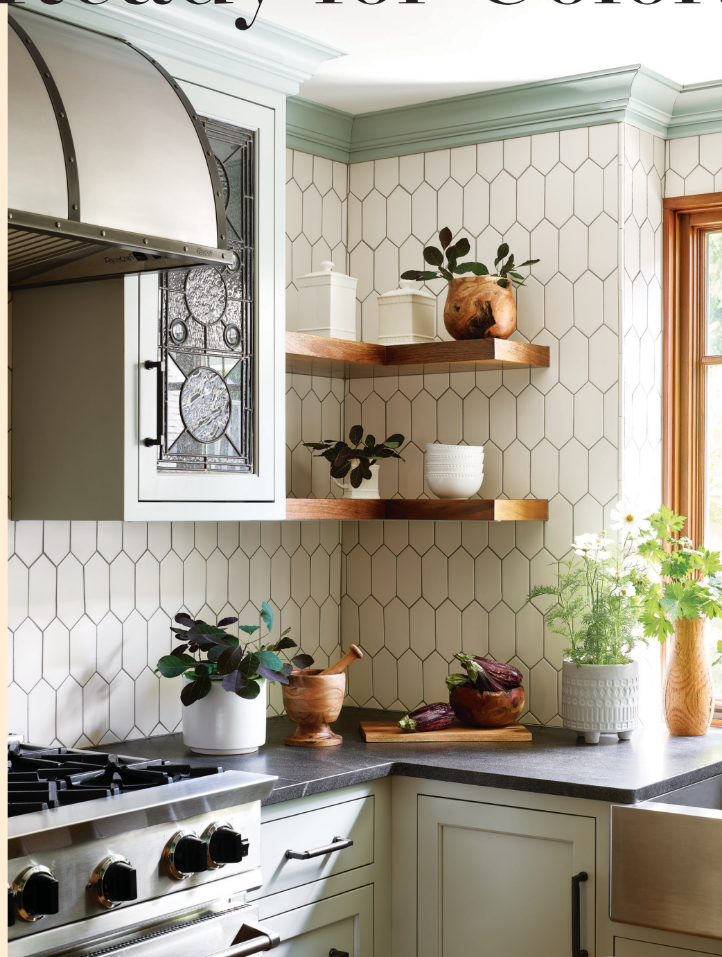
Five households. Two cities. One giant splash of color. From a pink Seaport stunner to a Cambridge classic with black built-ins, the most striking local kitchen designs bring personality in spades.

JARED KUZIA (LEFT), JOYELLE WEST (RIGHT)